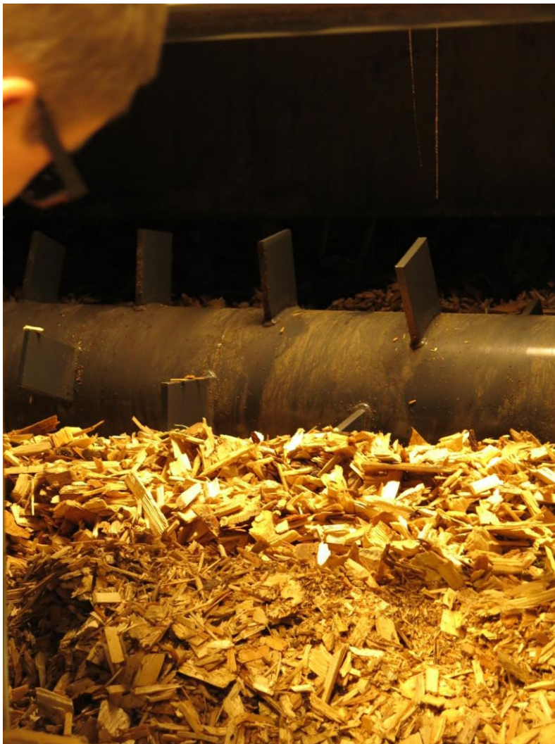
Wood chip feeding into a LAKA gasification boiler in the Pälkäne district heating plant.

In the end of the day Mr Kari Huttunen from Defence administration presented their plans to invest new biomass plants in Finland. They are targeting to renovate 20 – 30 oil-heating plants to biomass. They will do 7 – 12 contracts with heating entrepreneurs. Target is to increase use of RES in 2016 by 70 – 80% in their heat supply.