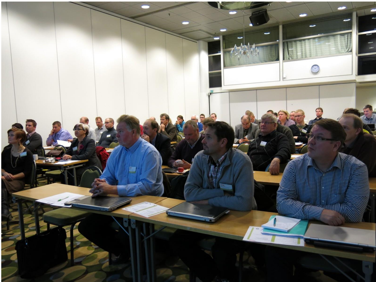
Audience in Heating Entrepreneurs' Day in Tampere on 24 October 2013.

Participant list is presented in Appendix II.